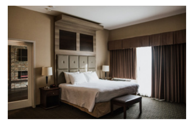
Best Western Mission City Lodge

ALWAYS MAKE SURE TO RESPECT FIRE BANS, NEVER LEAVE A FIRE UNATTENDED, AND PUT FIRES OUT COMPLETELY.