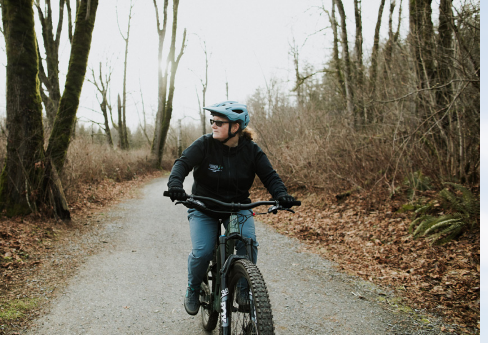
Fraser River Heritage Park Trails