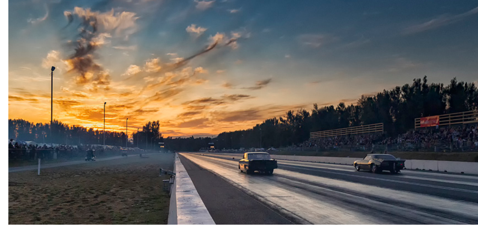
Mission Raceway Park

FOR MORE INFORMATION ON GOLF COURSES IN MISSION HEAD TO: TOURISMMISSION.CA/EXPLORE