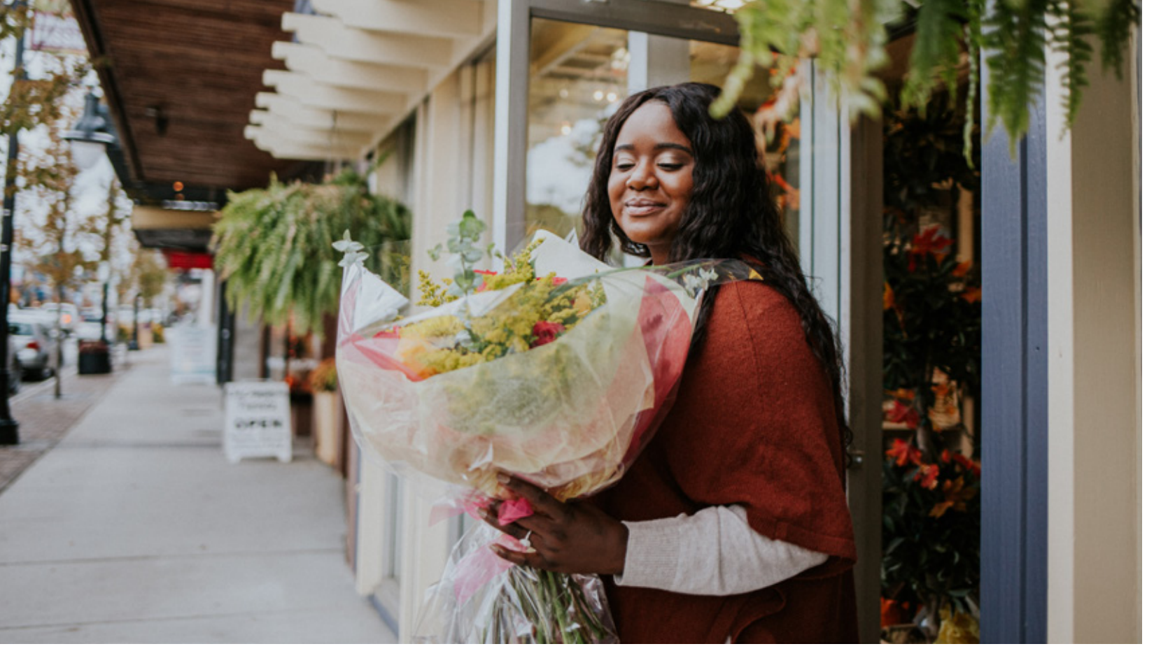
Magnolias on Main, Downtown Mission