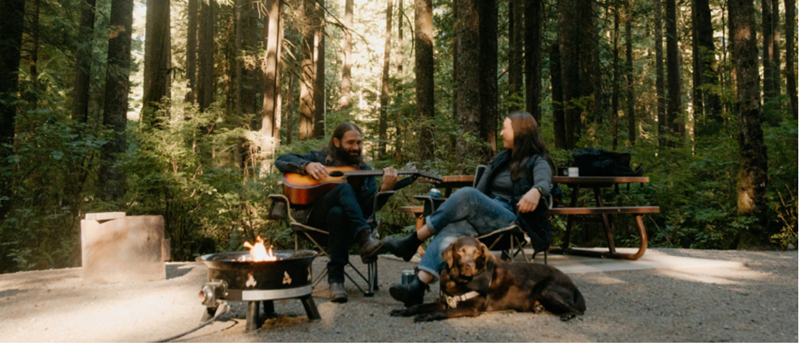
Rolley Lake Provincial Park Campsite