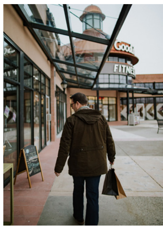
The Junction Shopping Centre

Experience the vibrancy of Mission's makers at the many artisan markets, including the Twilight Treasures Artisan Market at Griner Park and Heritage Park's summer markets. Come November, explore the holiday markets full of local crafts, food, and unique gifts.